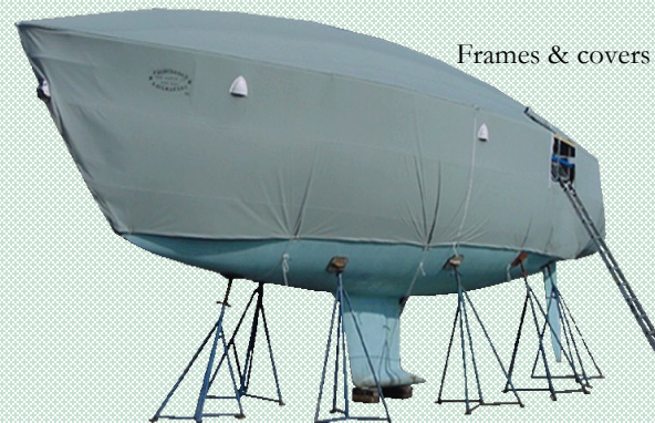
Frames & covers

For over 70 years, Fairclough has been a family-owned company dedicated to making the finest cruising sails and custom marine canvas for boat owners. Through continued innovation and improvement, we've developed the finest winter storage products available today Fairclough Custom Boat Frames and Covers . As the originators of this system, we've often been copied, but for protection, beauty, workmanship, and long-lasting value, we've never been duplicated.